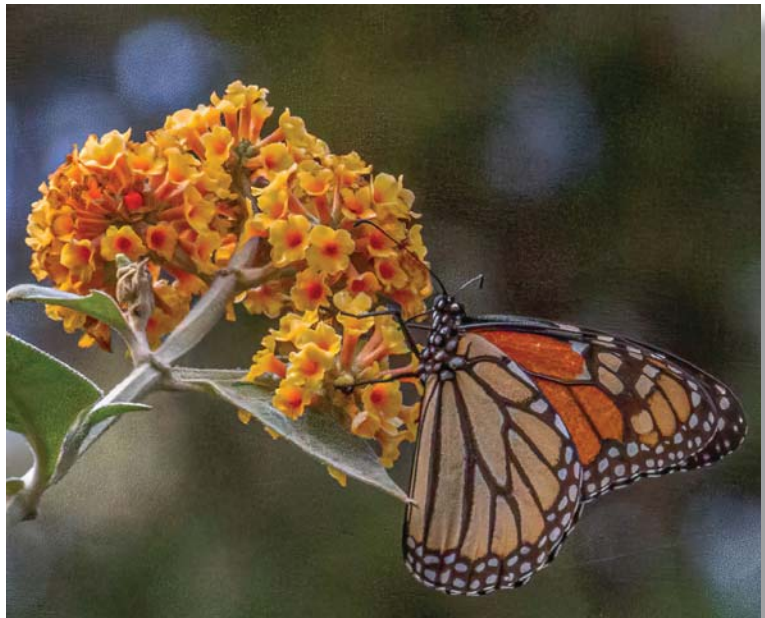
Monarch Butterfly ( Danaus Plexippus)