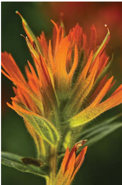
Indian Paint Brush (Castilleja affinis) Jared Ikeda